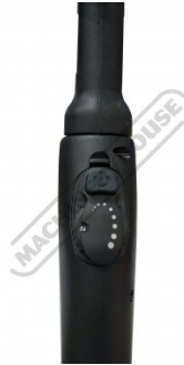
Amperage Control Dial and On Off Button