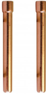
W585 2 x 1.6mm Collets