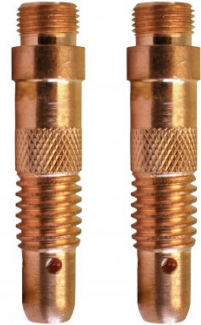
W586 2 x 1.6mm Collet Holders