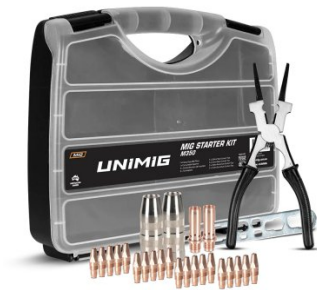
W501A M350 MIG Torch Consumables Starter Kit