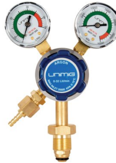
W160A Argon Gas Regulator-Twin Gauge