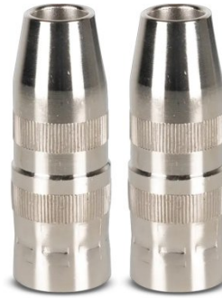
W5015 M350 Conical Insulated Gas Nozzles