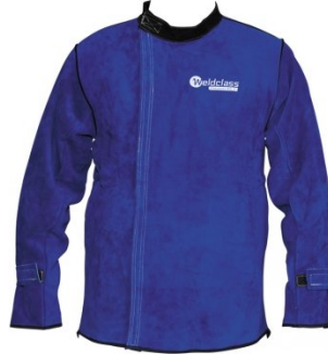
W1002A Professional Promax BL7 Welding Jacket