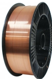
W135 Ø0.9mm Mild Steel MIG Welding Wire