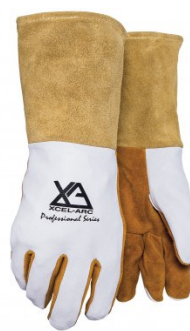
W101 TIG Welding Gloves - 310mm