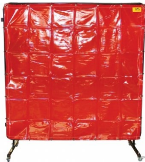
W225 Welding Curtain