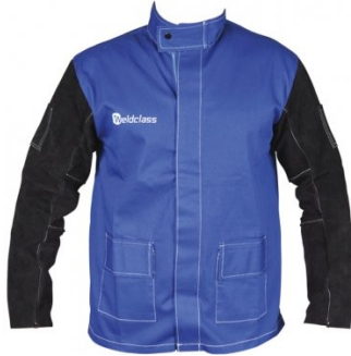
W1001A Promax Blue FR Welding Jacket