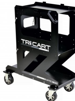
W2415 TRI-CART Multi-Machine Welding Trolley