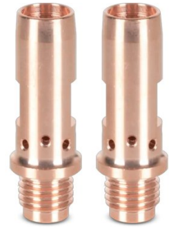
W5017 M350 Tip Adapter