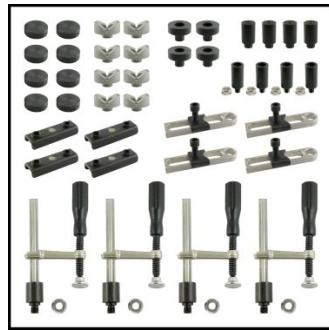
W08510 Weld Clamps with Locking Nuts (2 Piece Pack)