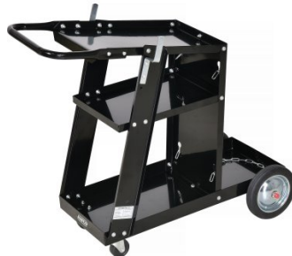
W241 Universal Welder Trolley