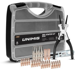
W501A M350 MIG Torch Consumables Starter Kit