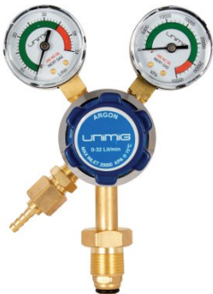
W160A Argon Gas Regulator-Twin Gauge