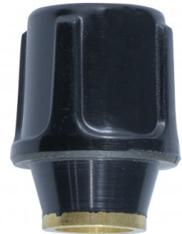
W6007 Short Back Cap