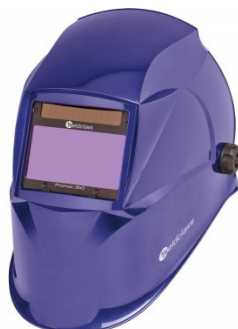
W002 Auto Darken Welding Helmet - 9-13 Shade