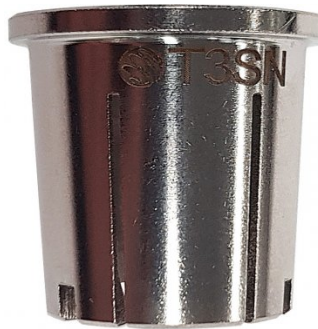
W6006 Heat Isolator