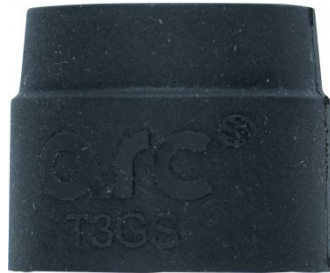
W6005 Head Gasket