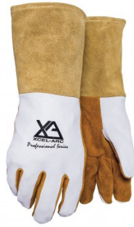
W101 TIG Welding Gloves - 310mm