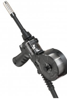
W181C Spool Gun - Light Duty