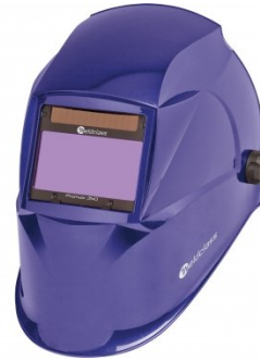
W002 Auto Darken Welding Helmet - 9~13 Shade