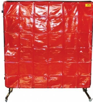
W225 Welding Curtain