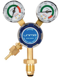
W160A Argon Gas Regulator-Twin Gauge