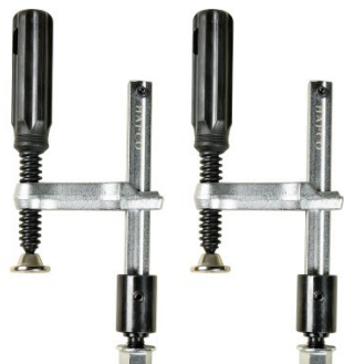
W08510 Weld Clamps with Locking Nuts (2 Piece Pack)