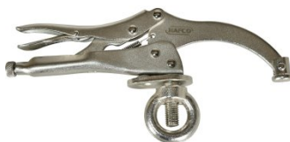
C-103 228mm Multi-Purpose Locking Clamp