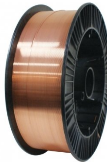
W136 Ø0.8mm Mild Steel MIG Welding Wire