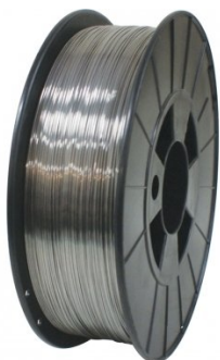
W145 Ø0.9mm Gasless Mild Steel MIG Welding Wire