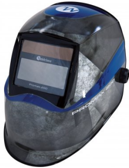
W001 Auto Darken Welding Helmet - 9~13 Shade