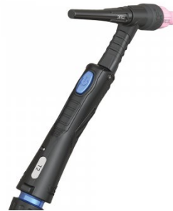
W171C Air Cooled Arc Torchology® TIG Welding Torch