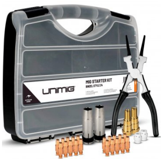
W496 SB24 Mig Torch Consumable Pack