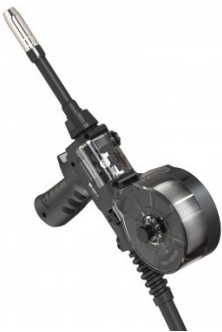
W181C Spool Gun - Light Duty