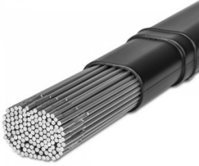
W127 Ø1.6mm TIG Filler Rod - Stainless Steel