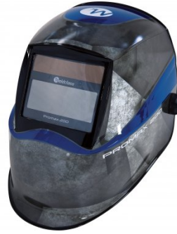
W001 Auto Darken Welding Helmet - 9~13 Shade