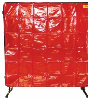
W225 Welding Curtain