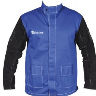
W1001A Promax Blue FR Welding Jacket