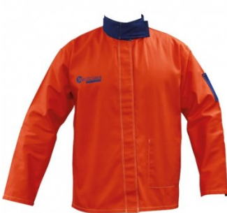
W1000A Promax HV5 Welding Jacket