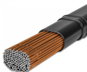
W125 Ø1.6mm TIG Filler Rod - Mild Steel