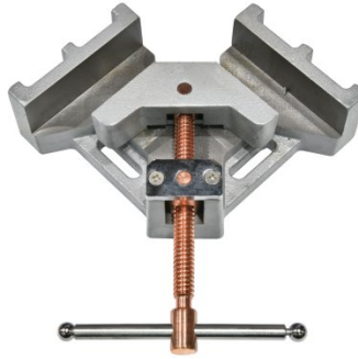
V099 90 degree Angle Vice Clamp