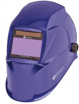
W002 Auto Darken Welding Helmet - 9~13 Shade