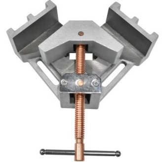
V100 90 degree Angle Vice Clamp