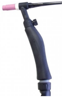
W171D Air Cooled TIG Welding Torch