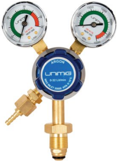
W160A Argon Gas Regulator-Twin Gauge