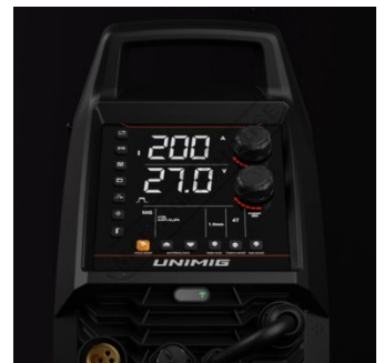
HD Backlit Interface