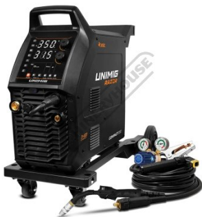
Shown with Included Accessories