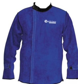
W1002A Professional Promax BL7 Welding Jacket