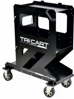
W2415 TRI-CART Multi-Machine Welding Trolley