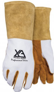
W101 TIG Welding Gloves - 310mm