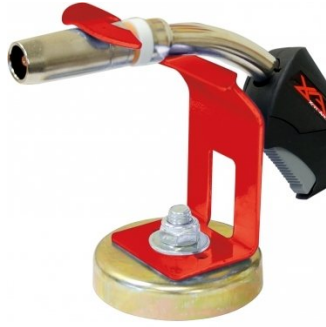
W10362 Magnetic MIG Torch Rest