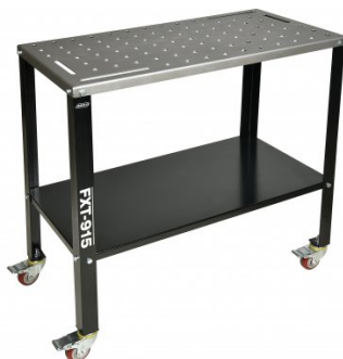
W08450 FIXTURE TABLE