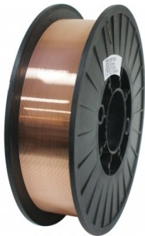
W142 Ø0.9mm Mild Steel MIG Welding Wire