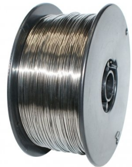
W145A Ø0.9mm Gasless Mild Steel MIG Welding Wire