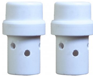
W576 2 x Gas Diffusers