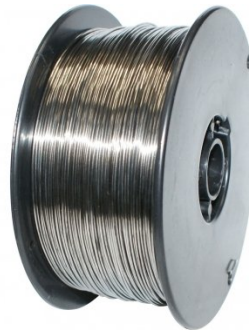
W145A Ø0.9mm Gasless Mild Steel MIG Welding Wire