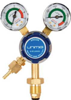
W160A Argon Gas Regulator-Twin Gauge