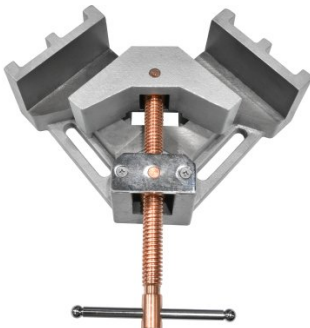
V100 90 degree Angle Vice Clamp