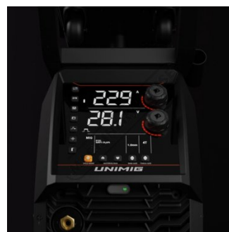
HD Backlit Interface