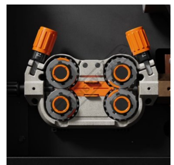
4 Geared Wire Drive