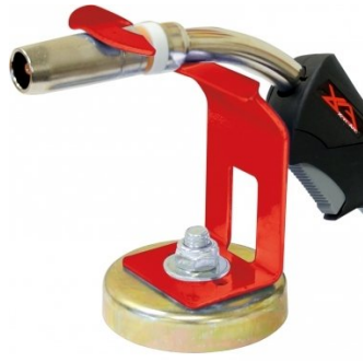
W10362 Magnetic MIG Torch Rest