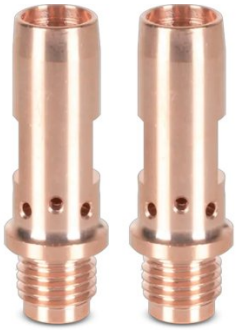
W5017 M350 Tip Adapter