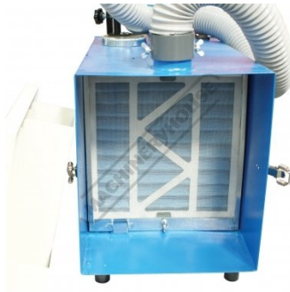
Easy Access to Filter