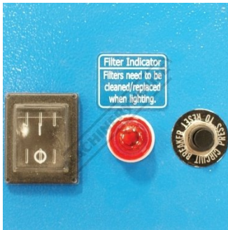
Filter replacement Indicator