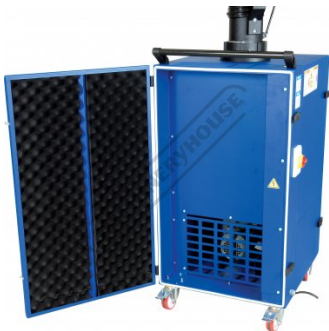
Rear Door Access Panel