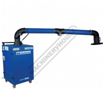
3 Metre Arm Extended