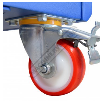
2 x Swivel Wheels with Brake