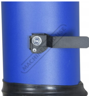
Air Flow Control Valve