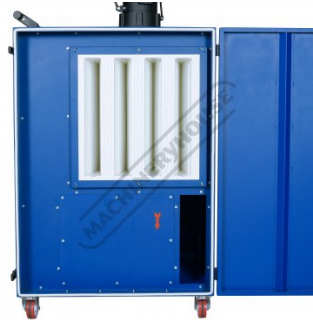
Right Side Door Access Panel