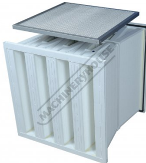
Pre Filter & Hepa Filter System