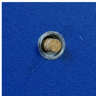
Inlet Spark Arrestor