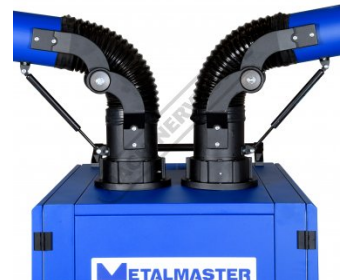
Dual Exo Joint with Gas Strut Supports