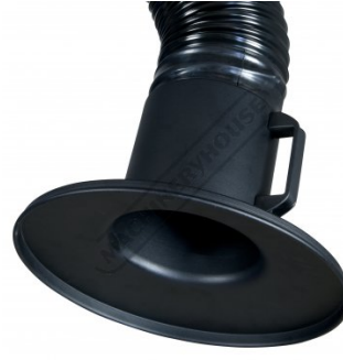
Fume Extraction Head