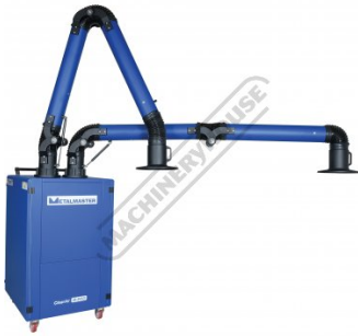
3 Metre Arm Extended