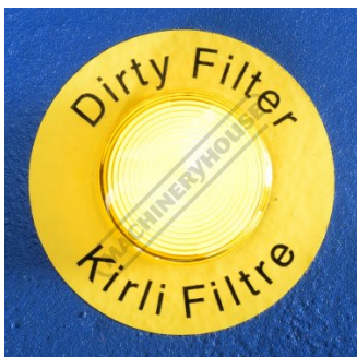
Dirty Filter Light Indicator