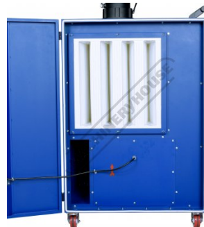
Left Side Door Access Panel