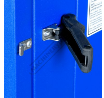
Quick Action Door Panel Locks