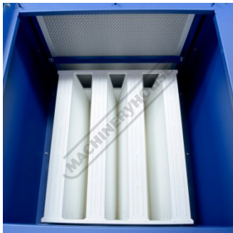
H13 Hepa Filter Assembly