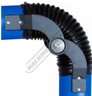
Exo Centre Arm Joint