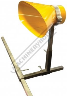
Right View Close Up