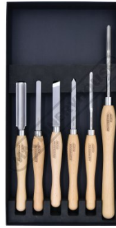
Top View In Case