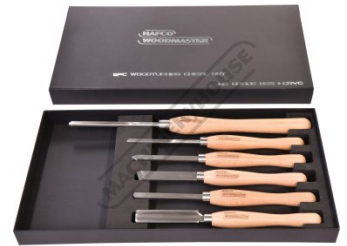
Box Packaging Open