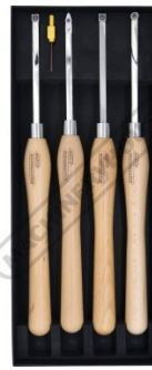
Top View In Case