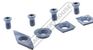
Replaceable Carbide Tips