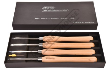
Box Packaging Open