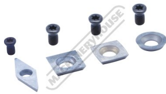
Replaceable Carbide Tips