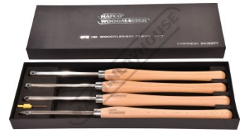
Box Packaging Open