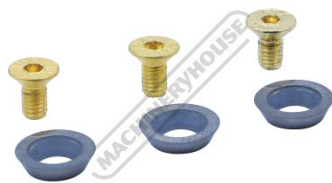
Replaceable Carbide Tips