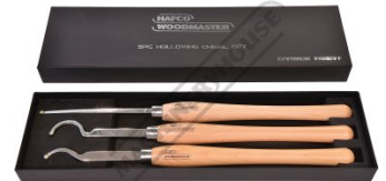
Box Packaging Open