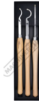
Top View In Case