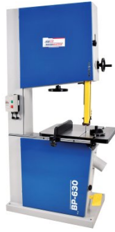
W429 Wood Band Saw