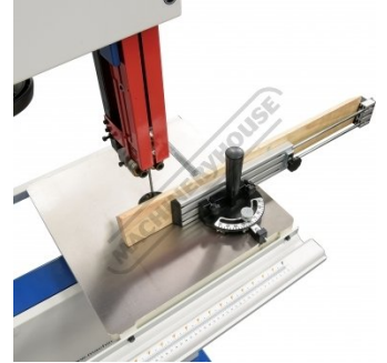
Shown on Wood Bandsaw