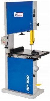
W425 Wood Band Saw