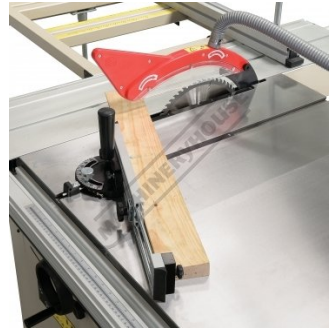
Shown on a Table Saw Side View