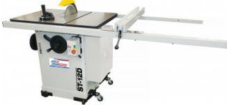
W454 Table Saw