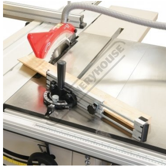
Shown on a Table Saw