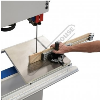
Shown on a Wood Bandsaw Action