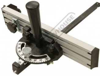
Fence Fully Closed