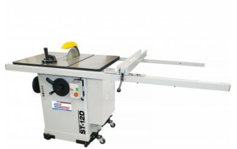
W455 Table Saw