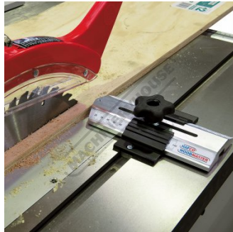
Shown In Use on Table Saw