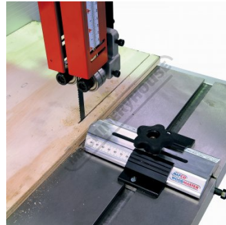
Shown In Use on Bandsaw