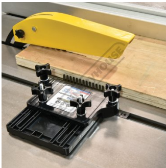
In Use Tabela Saw