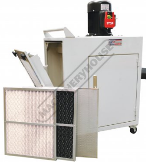
3 Stage Filter System - 1 Micron