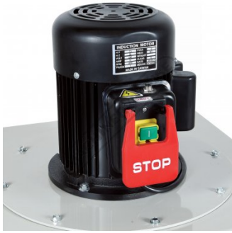
Motor & Safety Emergency Power Switch