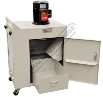
Removable Dust Collection Bin