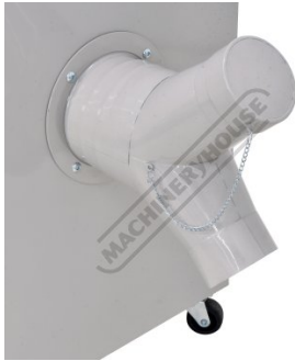
100 Duel Inlets