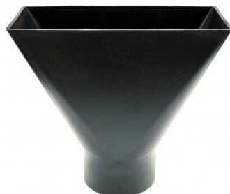
W338A Wood Lathe - Dust Chute Hood