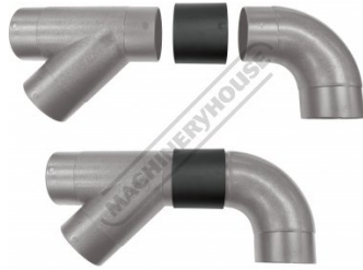
Shown Connecting Dust Fittings Together