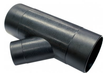
W3375 Dust Hose Y Adaptor