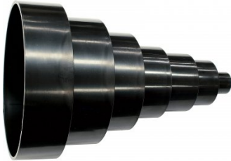
W3346 Dust Hose Stepped Reducer