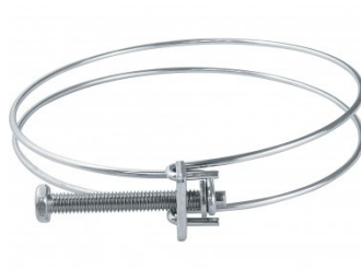
W341 Dust Hose Clamp