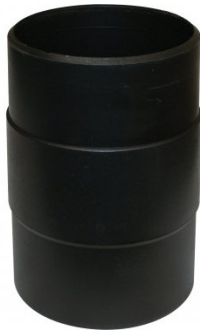
W334B Dust Hose Joiner