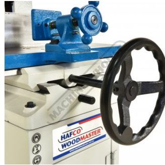
Cross slide and table travel handwheel