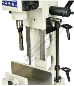
Vertical Head Stroke Adjustment