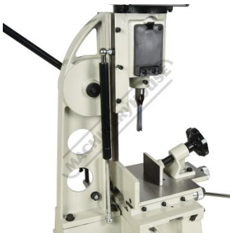
Gas Strut to Counterbalance Head Weight