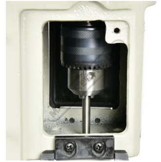
Drill Chuck Access