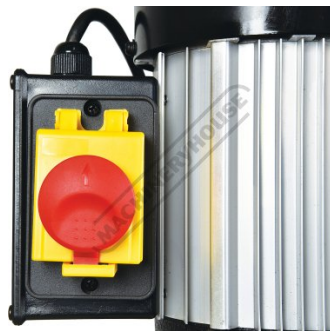
Magnetic Switch Emergency Stop