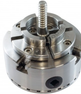
Shown With Wood Screw