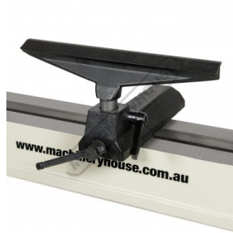
Standard Tool Rest