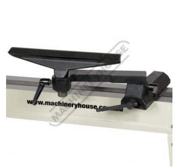
Outrigger Tool Rest