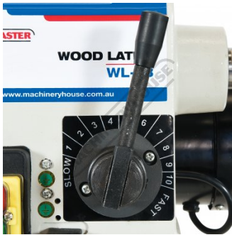
Variable Speed Lever