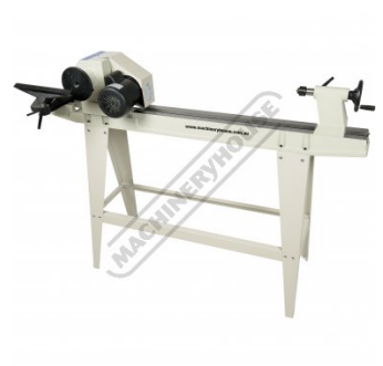
Bowl Turning Setup Right View