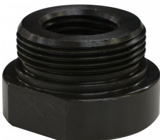
W3665 Scroll Chuck Insert - 1" x 10TPI