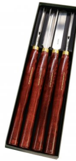
W3039 HSS Wood Turning Tools - 4 Piece Set