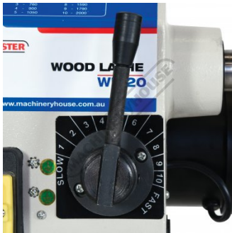
Variable Speed Lever