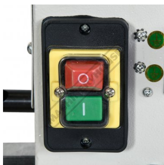
Switch On Off