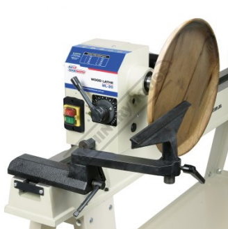
Shown Set Up with Bowl