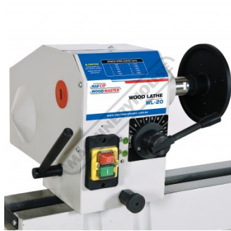
Headstock Left View