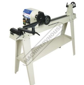
Bowl Turning Set Up Left View