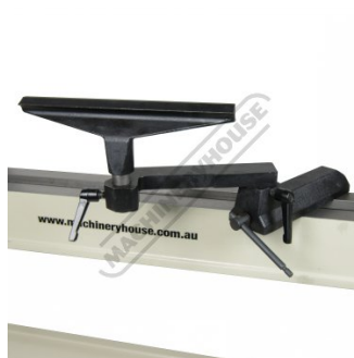
Outrigger Tool Rest