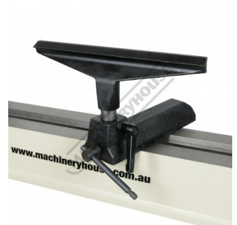
Standard Tool Rest