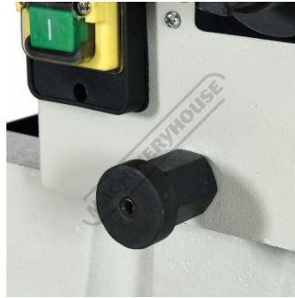
Swivel Head Release Lock