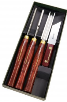
W3034 HSS Wood Turning Tools - 4 Piece Set