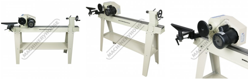
Bowl Turning Set Up Front View