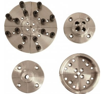
W375 Scroll Chuck Accessory Kit