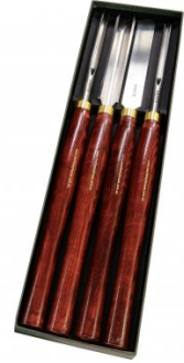
W3039 HSS Wood Turning Tools - 4 Piece Set