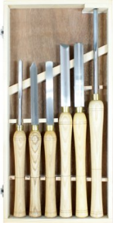
W302 HSS Wood Turning Tools - 6 Piece Set