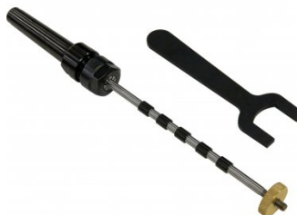
W306 Pen Mandrel Set - 2MT