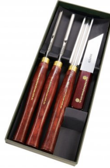
W3034 HSS Wood Turning Tools - 4 Piece Set