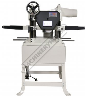
W414 Side View