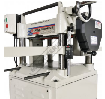
Robust 4 Post Design