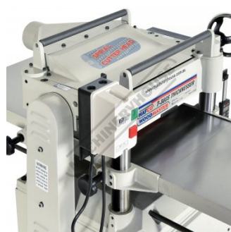
Feed Return Rollers