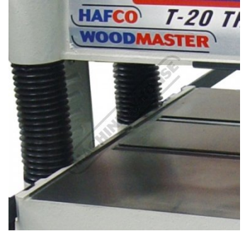
Robust 4 Post Design