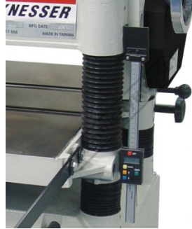
Digital Height Readout