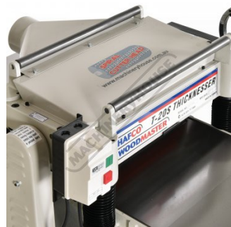
Feed Return Rollers