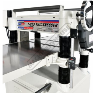
Robust 4 Post Design