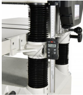
Digital Height Readout