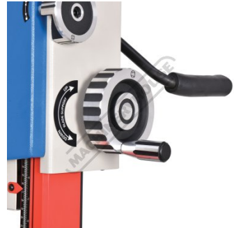
Blade Guide Hand Wheel