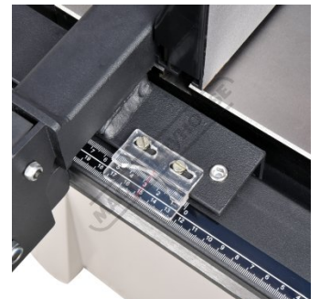
Sliding Rip Fence Scale