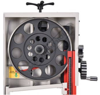
Heavy Duty Cast Iron Wheels