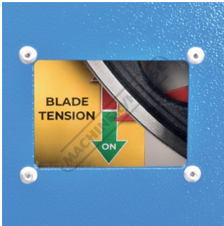
Blade Tension Window