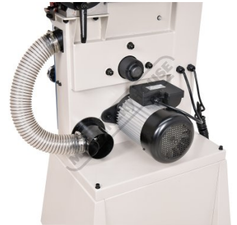
100mm Side Dust Chute