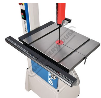
Large Cast Iron Table