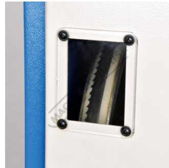
Blade Viewing Window