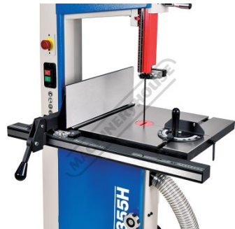
Sliding Rip Fence Up Position