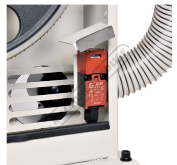
Safety Micro Switch on Doors