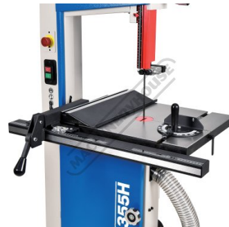
Sliding Rip Fence Down Position