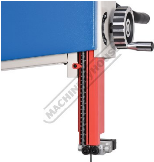
Blade Guide Scale