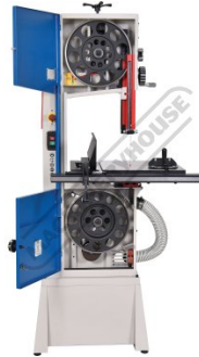
Shown With Blade Guards Open