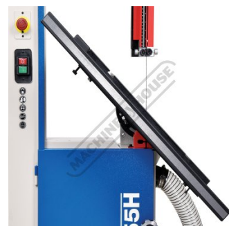
Table Tilts to 45 Degrees