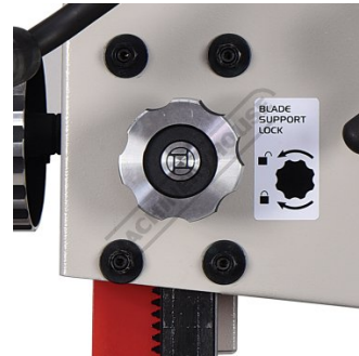
Quick Action Blade Tension Lever