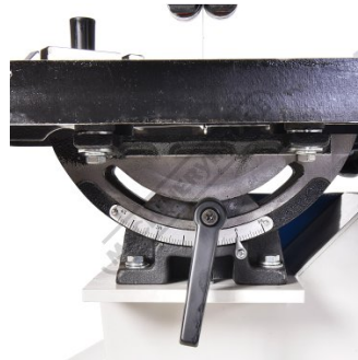
Table Tilt Adjustment