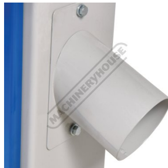
100mm Side Dust Chute