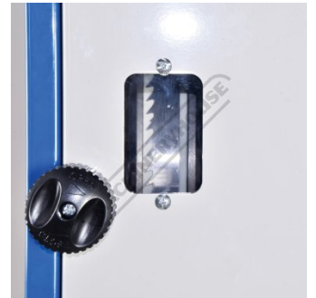
Blade View Window