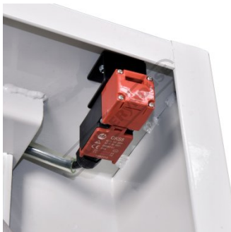
Safety Micro Switch on Doors