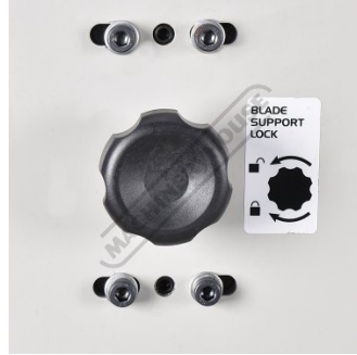
Blade Support Lock