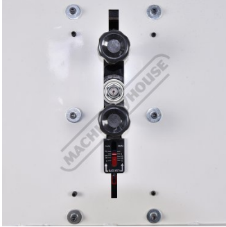
Blade Width Tension