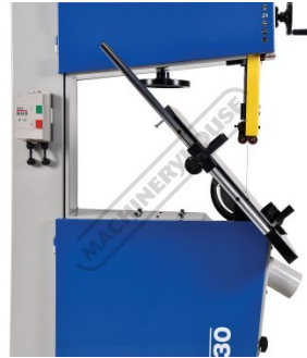
Cast Iron Table Tilts to 45 Degrees