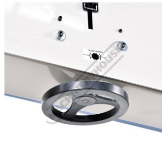
Blad Tension Lever