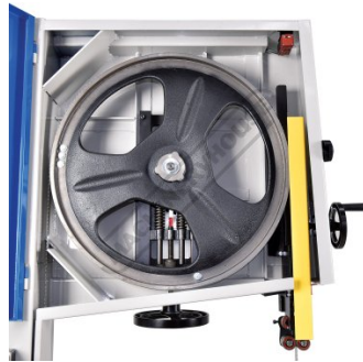
Heavy Duty Cast Iron Wheels