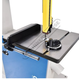
Cast Iron Table