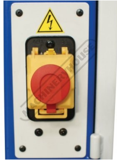
Magnetic Stop Switch