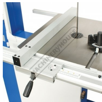
Sliding Rip Fence