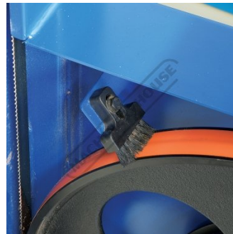
Blade Wheel Cleaning Brush