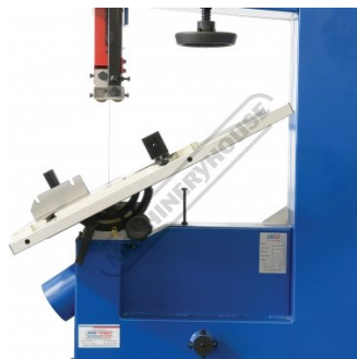
Cast Iron Table Tilts to 45 Degrees