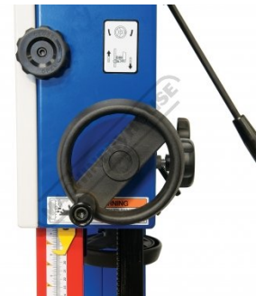
Blade Guide Height Adjustment Handle