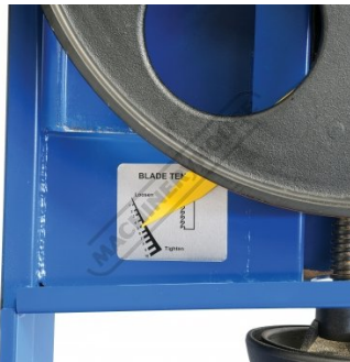
Blade Tension Sight Indicator