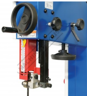
Rack & Pinion Adjustment on Top Blade Guide