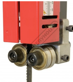
Ball Bearing Blade Guides