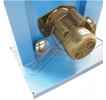
100mm Bottom Rear Dust Chute