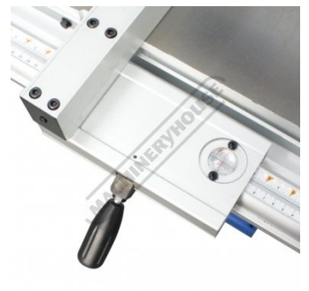
Rip Fence with Magnified Scale View