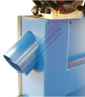
100mm Dust Chute