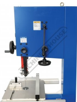
Quick Action Blade Tension Lever