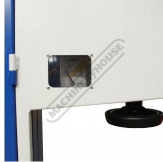
Blade Tension View Window