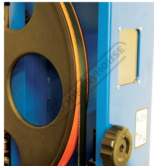
Orange Tyre for Ease of Blade Alignment Through Window