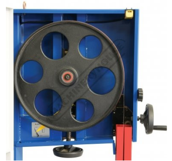
Heavy Duty Cast Iron Wheels