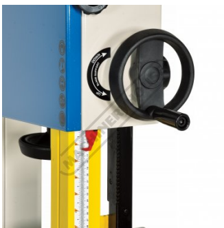
Adjustment Rack Pinion Cut Height