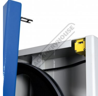
Safety Micro Switch On Door