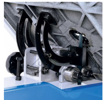
Lower Ball Bearing Blade Guide