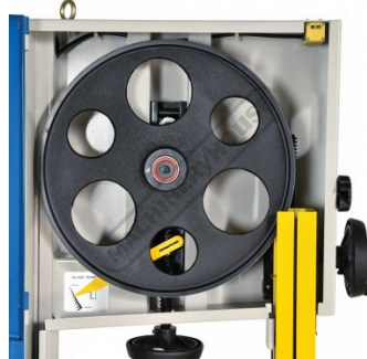
Heavy Duty Cast Iron Wheels