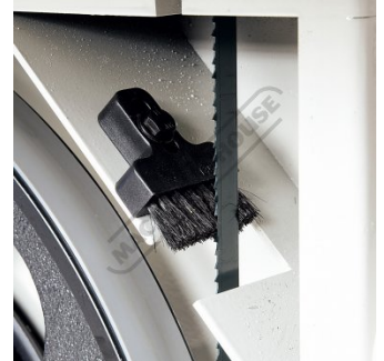
Blade Cleaning Brush