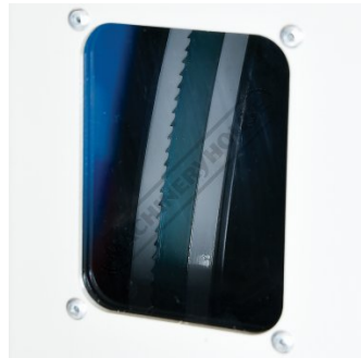
Blade View Window