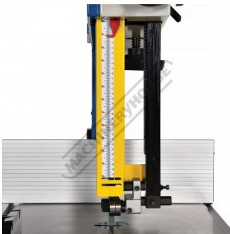
Blade Height Scale