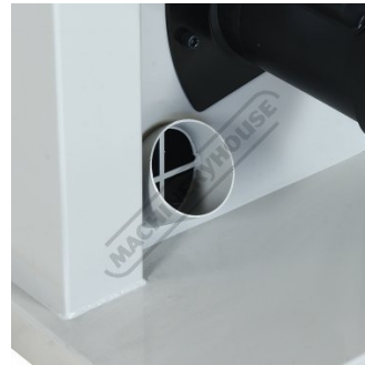
100mm Bottom Rear Dust Chute