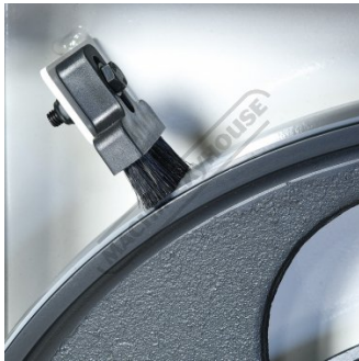
Wheel Cleaning Brush