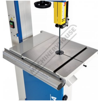
Large Cast Iron Table