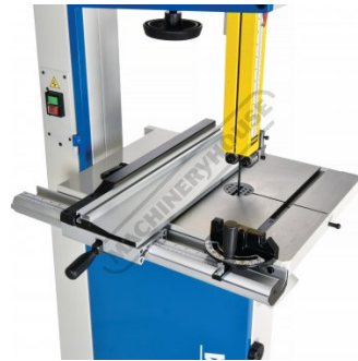
Rip Fence Shown In Low Position