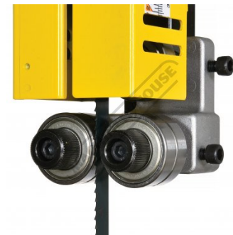
Ball Bearing Blade Guide