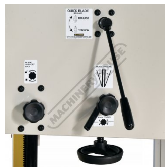
Quick Action Blade Tension Lever