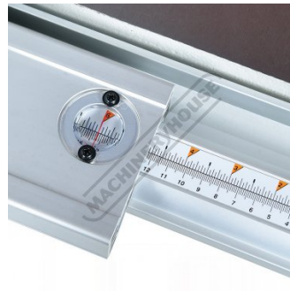
Rip Fence With Magnification Scale View