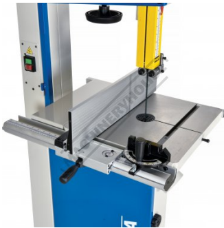
Rip Fence Shown In High Position