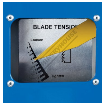
Blade Tension Window