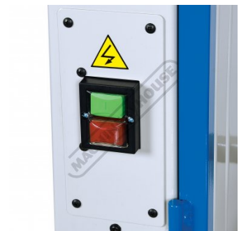
ON OFF Switch