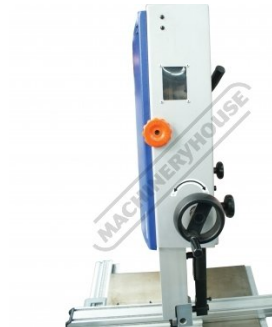
Cut Height Adjustment Dial