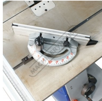
Mitre Guide 0 45 degrees