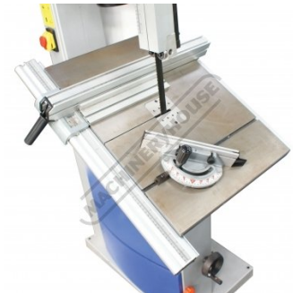
Sliding Rip Fence Table