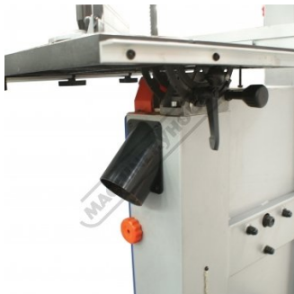
100mm Top Dust Chute