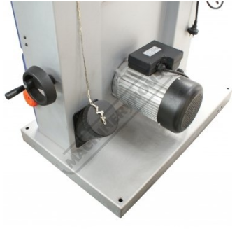
100mm Bottom Dust Chute