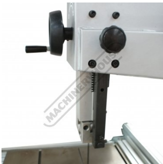
Rack Pinion Blade Guides