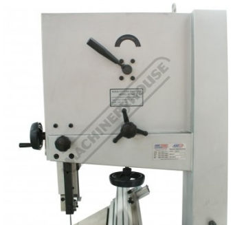
Blade Tension Dial and Quik Action Blade Lever