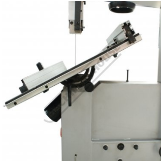
Tilting Table 0 45 degrees