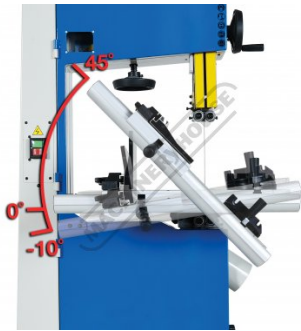
Table Adjustment Angles