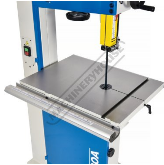
Large Cast Iron Work Table