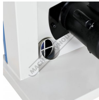
100mm Bottom Rear Dust Chute