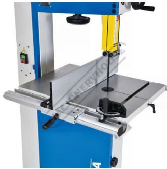
Rip Fence Shown In High Position