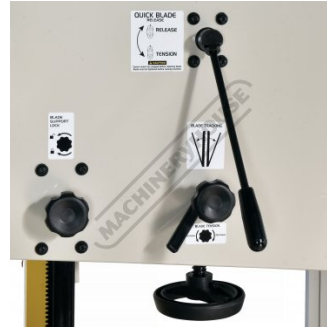
Quick Action Blade Tension Lever