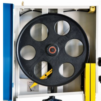
Heavy Duty Cast Iron Wheels