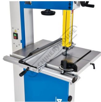
Rip Fence Shown In Low Position