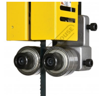
Ball Bearing Blade Guide