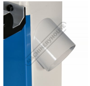
100mm Side Dust Chute