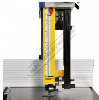
Blade Height Scale