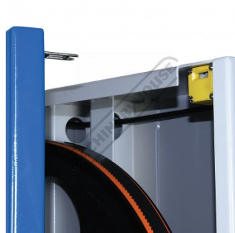
Safety Micro Switch On Door