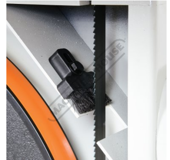
Blade Cleaning Brush