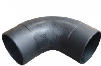
W337 Dust Hose Y Adaptor