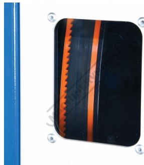
Blade View Window