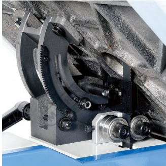
Lower Ball Bearing Blade Guide