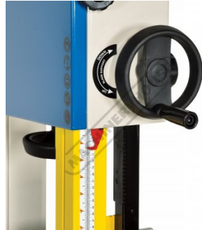
Adjustment Rack Pinion Cut Height