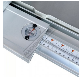
Rip Fence With Magnification Scale View