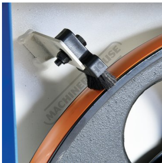
Wheel Cleaning Brush