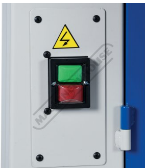
On Off Switch