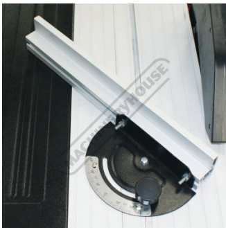
Mitre Guide Shown with Attached Rip Fence