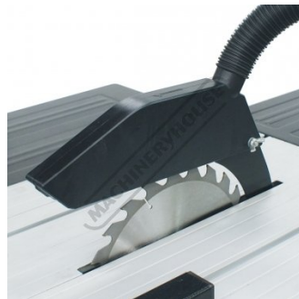
Saw Blade Guard with Dust Chute