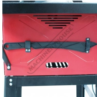
Material Push Stick