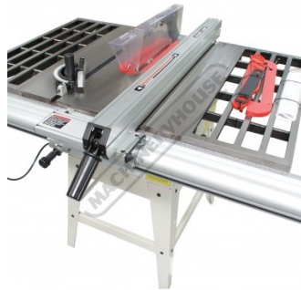
Heavy Duty Rip Fence with Micro Adjustment