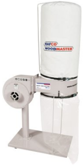
W332 Dust Collector