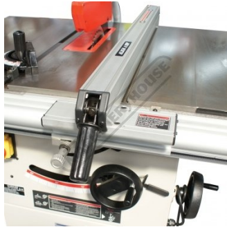
Heavy Duty Rip Fence with Micro Adjustment