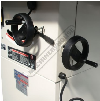
Blade Adjustment Handles