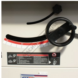
Blade Angle Adjustment