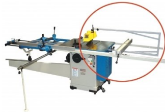
W459 Saw Guard Hood