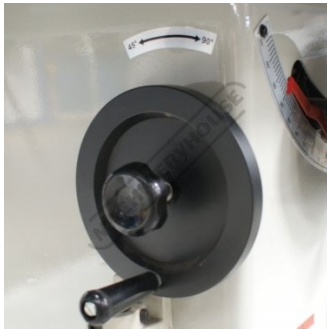
Tilt Arbor to 45 degrees