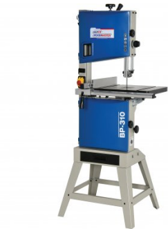
W952 Wood Band Saw