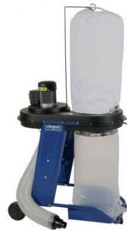
W886 Dust Collector