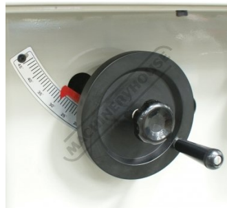
Blade Height Adjustment Handle & Angle Scale