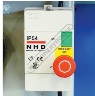
Magnetic Safety Switch