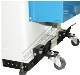
Swivel Wheels on Mobile Base with Leveling Screws