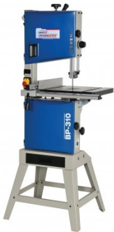
W952 Wood Band Saw