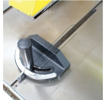
Heavy Duty Mitre Guide 60 degrees