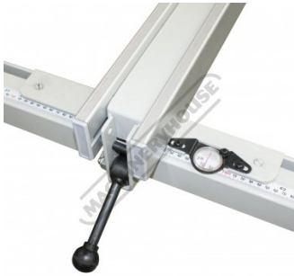
Single Lock Lever on Rip Fence with Magnified Scale