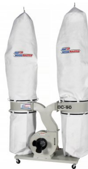
W331 Industrial Dust Collector