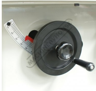
Blade Height Adjustment Handle & Angle Scale