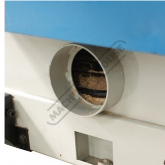
100mm Dust Chute