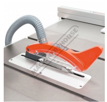
Blade Guard with Dust Hose