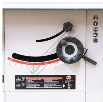
Blade Angle Adjustment