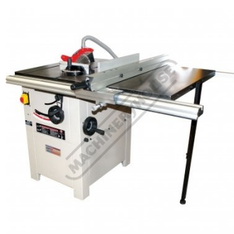
Shown with Table Support & Leg