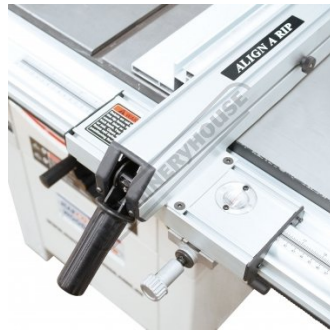
Heavy Duty Rip Fence with Micro Adjustment