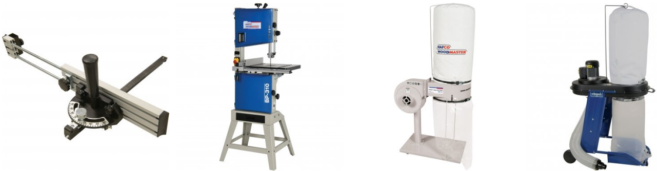
W886 Dust Collector