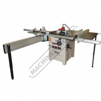
Shown With Optional Sliding Table