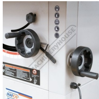
Blade Adjustment Handles