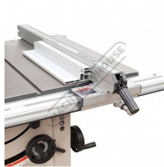
Rip fence Left View