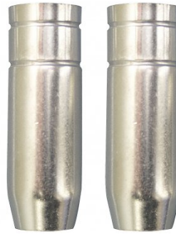
W535 2 x Conical Nozzles