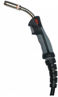
W559 MIG Torch - 4 Metre