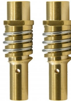
W537 2 x Contact Tip Holders